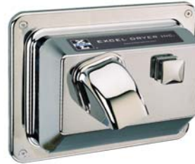
R76-C (Hand) RH76-C (Hair)