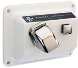
R76-W (Hand) RH76-W (Hair)