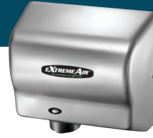
Steel Satin Chrome