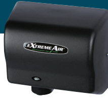
Steel Black Graphite