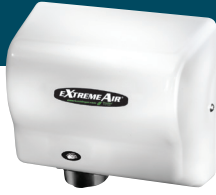
Steel White Epoxy