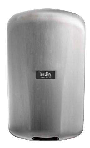
TA-SB Brushed Stainless Steel