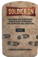
TA-SI 3 Custom Special Image