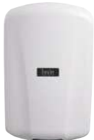
TA-W White Epoxy Painted