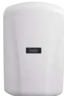
TA-ABS White Polymer (ABS)