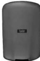
TA-GR Graphite Textured Painted