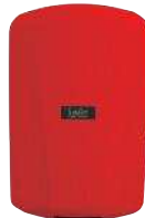
TA-SP 3 Custom Special Paint