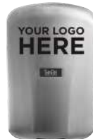
TA-SB-SI 3 Brushed Stainless Steel Special Image